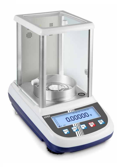
KERN ALJ 200-5DA with optional ioniser ■, see accessories. High-precision semi-micro analytical balance. Thanks to its high level of precision, it is ideal for calibrating pipettes Note: To prevent evaporation we recommend economical capillary tubes (see standard 8655)