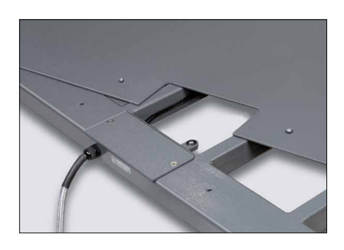
■ Weighing plate can be unscrewed - The weighing plate can be conveniently unscrewed for maintenance or cleaning purposes