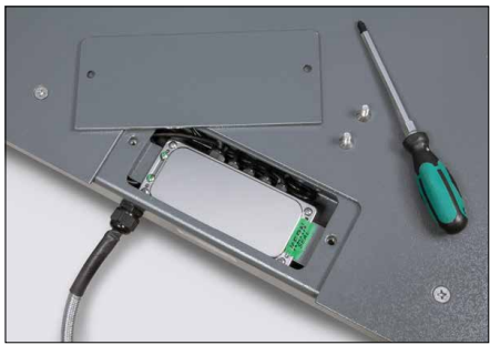
Easy levelling of the weighing bridge as well as access to the junction box from above