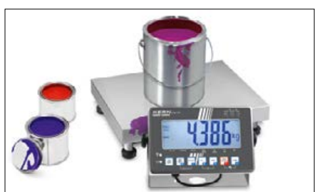
Durable stainless steel weighing plate