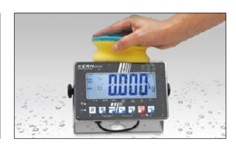
Stainless steel display device with protection IP68, hygienic and easy to clean