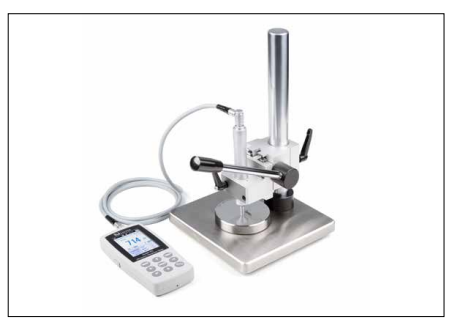
Test stand for repeatable movements during testing. In this way you can avoid errors which could occur in manual handling of the sensor. This ensures even more stable measurements and more precise measuring results, see Accessories