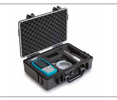
Scope of delivery: Standard block for calibration (approx. 61 HRC), USB cable, display unit, UCI sensor unit, transport case, software to transfer the saved data to the PC, other accessories

Mini statistics function: Display of the measuring result, the number of measurements, the maximum and minimum value as well as the average value and the standard deviation