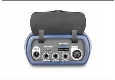
...and data transfer using MicroSD (4G) memory card (included in delivery), RS-232 or USB