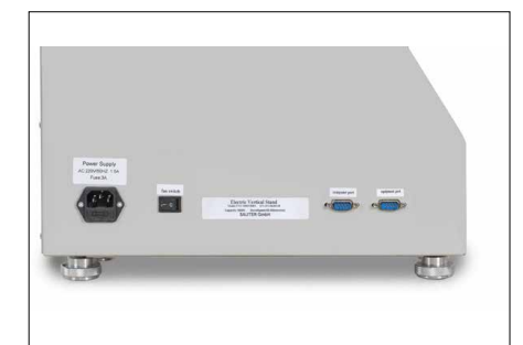
Interface for data transmission from the SAUTER FH measuring device and for controlling the test stand with SAUTER AFH software