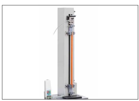
A wide range of application possibilities because of its large travelling distance