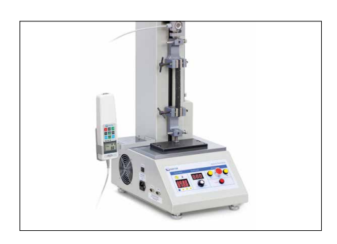
Solid and flexible fixing options for many clamps and accessories from the SAUTER product range, see Accessories